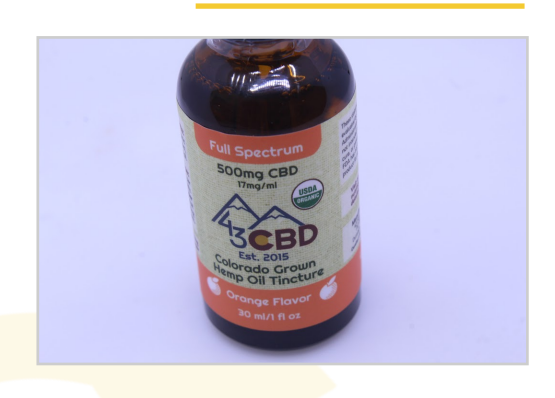
Unit: 1 oz Units Per Package:1